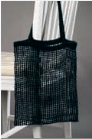
Project: Shoulder bag and scarf in leno, 1/08.