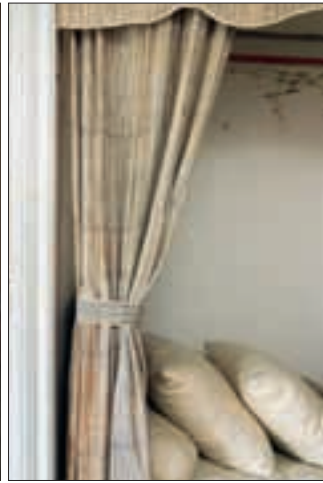
Theme: 18th Century 2/08