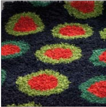
Rya rug directions 1/06