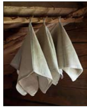
Handtowels with a loop in the centre, directions, 4/07