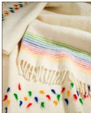
Blanket with felted tufts, directions 4/06