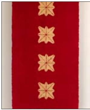
Print rug, linen, weave directions, 3/07