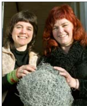
Article, Aranea, 3/06