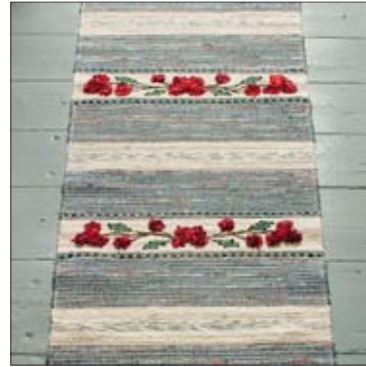
'Dream of Elin' rag inlay rug, directions, 2/06