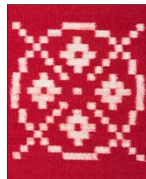
Article, Eva Stephenson-Möller, 2/07