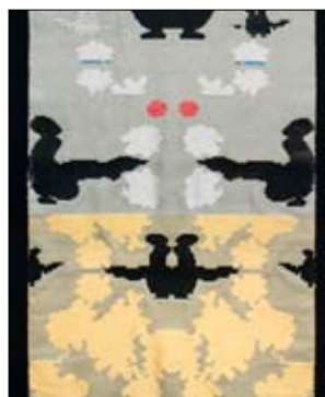
Article, Kaisa Melanton, 1/07