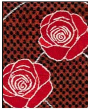
Article, Eva Rodenius, 3/07