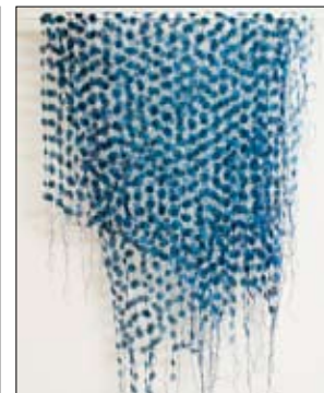
Article, Kazuyo Nomura, 4/06