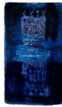
Finnish ryas, 4/07